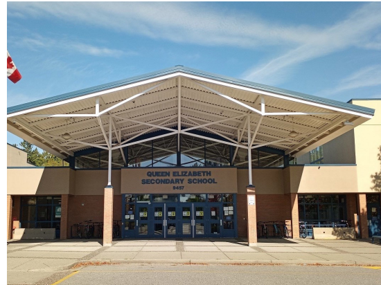
[From left] The Kinetic project team reviewing Touchplan and their Kanban Board; and the completed Queen Elizabeth Secondary School.

"This process of implementing LPS® successfully on the projects results from establishing and fostering relationships. The relationship is nurtured from the executive level to the team in the field, including the trades. Our approach was to take time to develop solid relationships and support the teams with robust training and implementation, which brought more clarity about the initiative and use of LPS® to the team members."