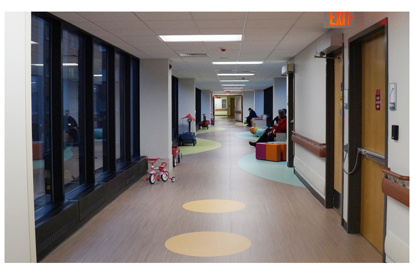
Renovation completed within an active hospital | Lansing, MI