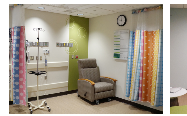
[From left] Work began in mid-September and finished in February ahead of schedule